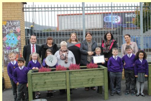
St Clare's Nature Corner

A big congratulations to everyone involved in the creation of 'St Clare's Nature Corner' Who were recently awarded The West Belfast Partnership Award